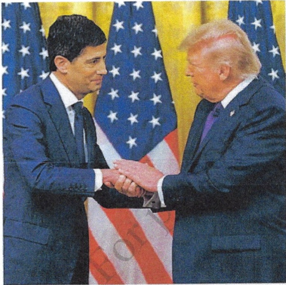
President Trump clasps Kevin Warsh's hand during his swearing-in as Federal Reserve chairman.